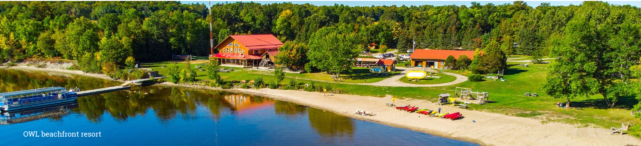
OWL beachfront resort

2 person and 4 person available. Ensuite with a composting toilet and water basin. Bedding and towels included.