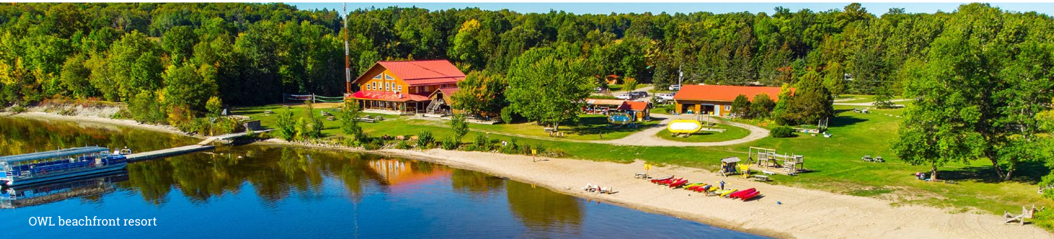
OWL beachfront resort

2 person and 4 person available. Ensuite with a composting toilet and water basin. Bedding and towels included.