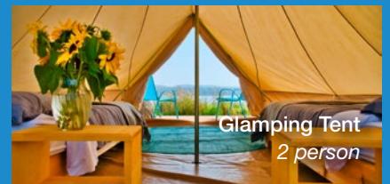
Glamping Tent 2 person