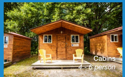
Cabins 4 - 6 person

40 OWL Lane, Foresters Falls, Ontario, K0J 1V0