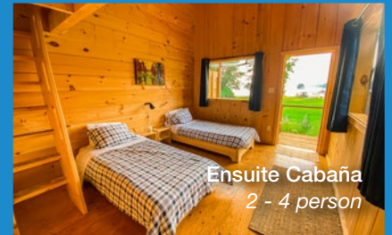
Ensuite Cabaña 2 - 4 person

Our all-inclusive overnight packages let you choose from a range of unique accommodations.